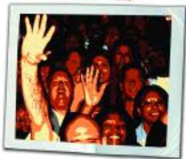
My new friends

What a Friend we have in Jesus What a friend we have in Jesus All our sins and grief to bear What a privilege to carry Everything to God in prayer!