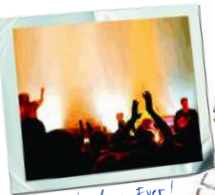
Best show - Ever!